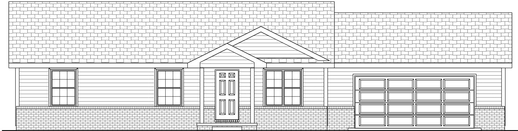
FRONT ELEVATION NY20612