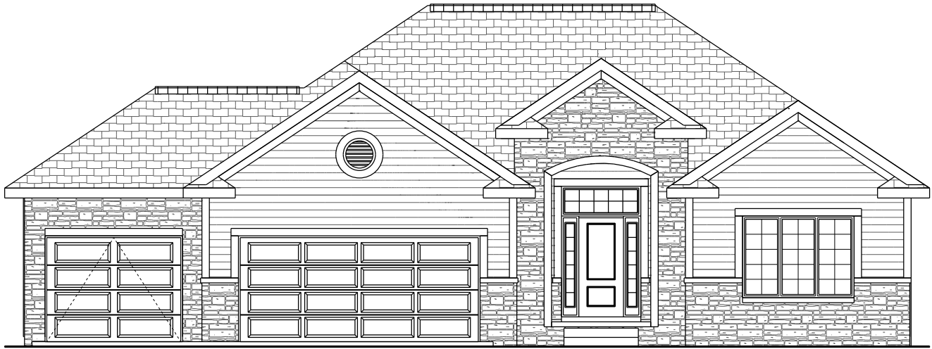
FRONT ELEVATION NV16219