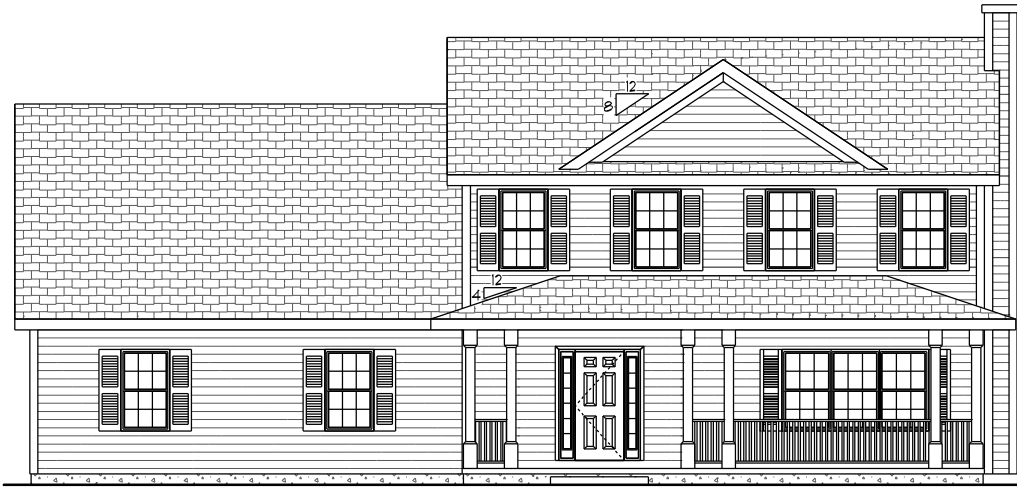
FRONT ELEVATION NV21514